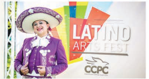
LATINO ARTS FESTIVAL \ \ PAGE 4