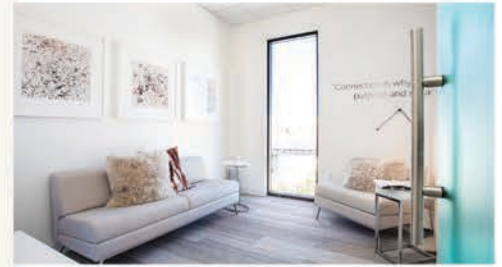
MENTAL WELLNESS COUNSELING SERVICES \ \ PAGE 2