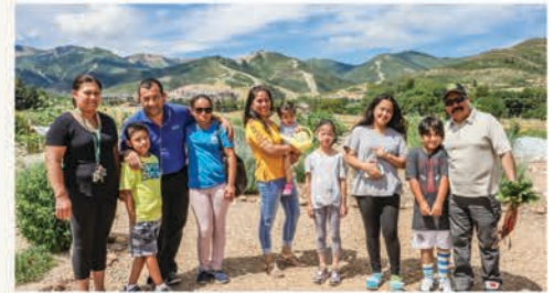
HUNGER AND FOOD INSECURITY \ \ PAGE 3